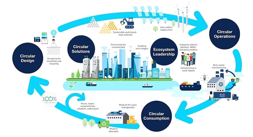
Figure 5. Digital circular economy eco-system for industrial green synthesis.

Consumer Engagement and Education Digital tools help educate and engage consumers in the circular economy. They enable information sharing, product traceability, and consumer involvement in recycling or repurposing initiatives, fostering a culture of sustainability and circularity. AI and machine learning algorithms incorporate for optimizing production