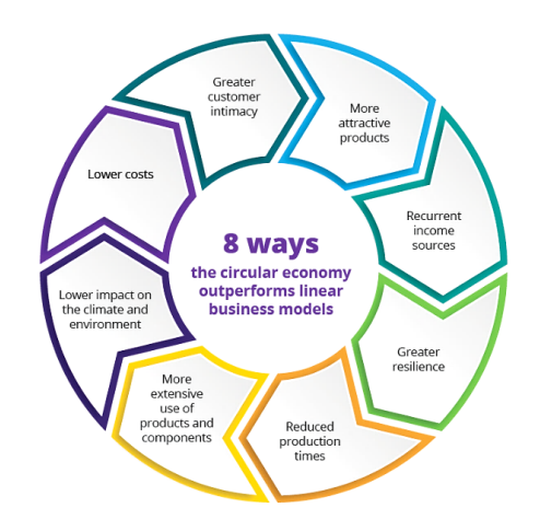
Figure 3. Linear business models conversion strategies for circular economy.