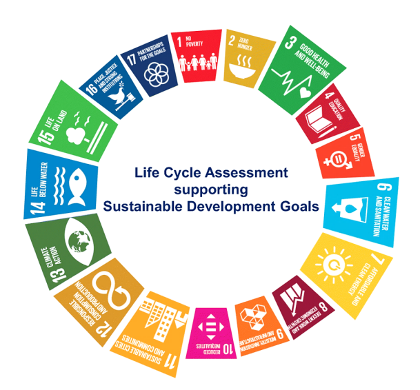
Figure 6. Role of each SDG's for green synthesis in circular economy model.