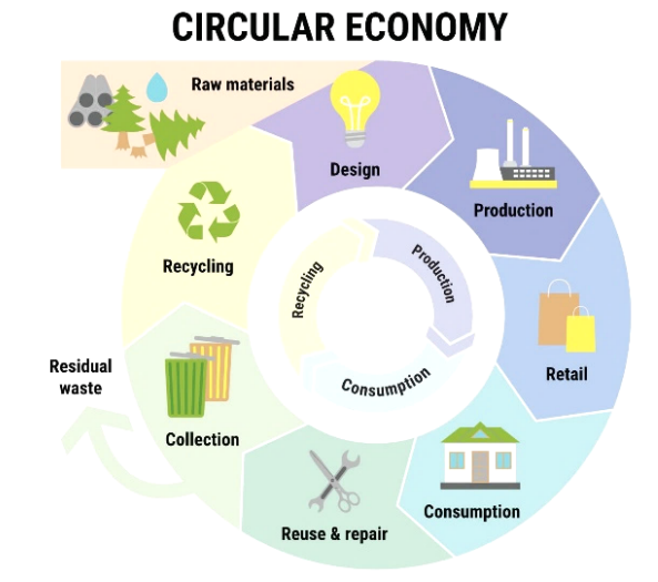
Figure 1. Circular economy model.

The principles of circular economy also emphasize the importance of designing products and processes with sustainability in mind. Industrial chemistry and environmental engineering can contribute by developing innovative materials, optimizing product lifecycles, and implementing eco-design strategies. By considering the entire life cycle of a product, from raw material extraction to end-of-life disposal industries can reduce environmental impacts and improve resource efficiency [3]. Figure 1 highlights the circular economy model.