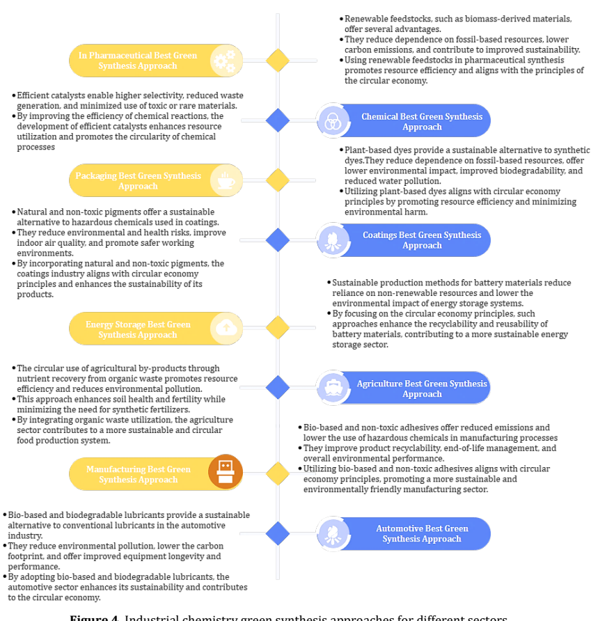
Figure 4. Industrial chemistry green synthesis approaches for different sectors.

Green synthesis incorporates bio-catalysis, which utilizes enzymes and microorganisms, as a sustainable alternative to traditional chemical processes. Bio-catalysis offers high selectivity, mild reaction conditions, and reduced energy requirements, thus contributing to the circular economy and environmental sustainability [50]. Green synthesis considers the environmental impact of the entire life cycle of a product, from the extraction of raw materials to the disposal. Life cycle assessment (LCA) methods are used to evaluate the environmental footprint and identify opportunities to improve the sustainability and circularity of chemical processes [51].