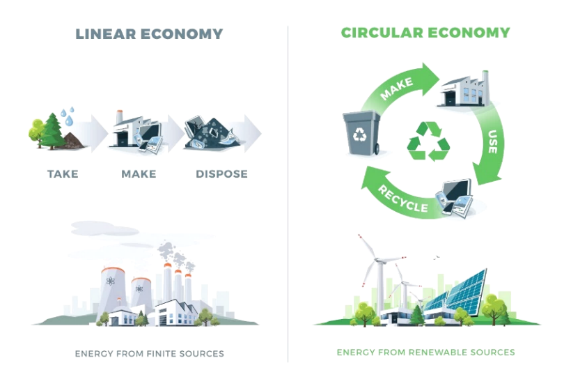
Figure 2. Linear economy vs the circular economy model.

Bio-composites possess desirable properties such as being lightweight, strength, and durability, while also being biodegradable or compostable. By utilizing bio resources and bio-composites, we enhance sustainability by reducing dependence on fossil-based materials, minimizing waste generation, and promoting circular economy principles.